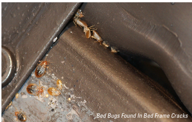
Bed Bugs Found In Bed Frame Cracks

A: Because Bed bugs are small and flat, they are able to squeeze into tiny cracks and crevices on the mattress and box spring, behind headboards, and inside furniture. They prefer to live in groups and are often found in clusters where the adults, nymphs and eggs are together in a protected area.